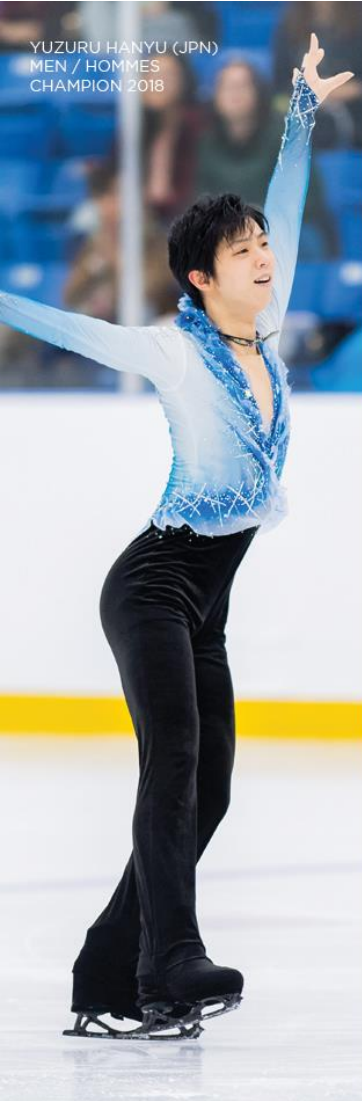
YUZURU HANYU (JPN) MEN / HOMMES CHAMPION 2018