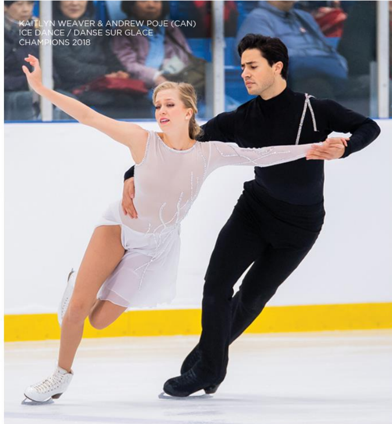
KAITLYN WEAVER & ANDREW POJE (CAN) ICE DANCE / DANSE SUR GLACE CHAMPIONS 2018